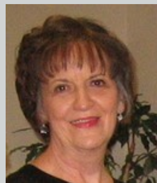
Sharon Rae Snowden Dance Promotion in the Community Award