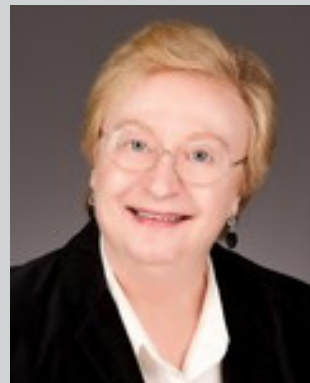
Gayle Kassing Dance Scholar Award